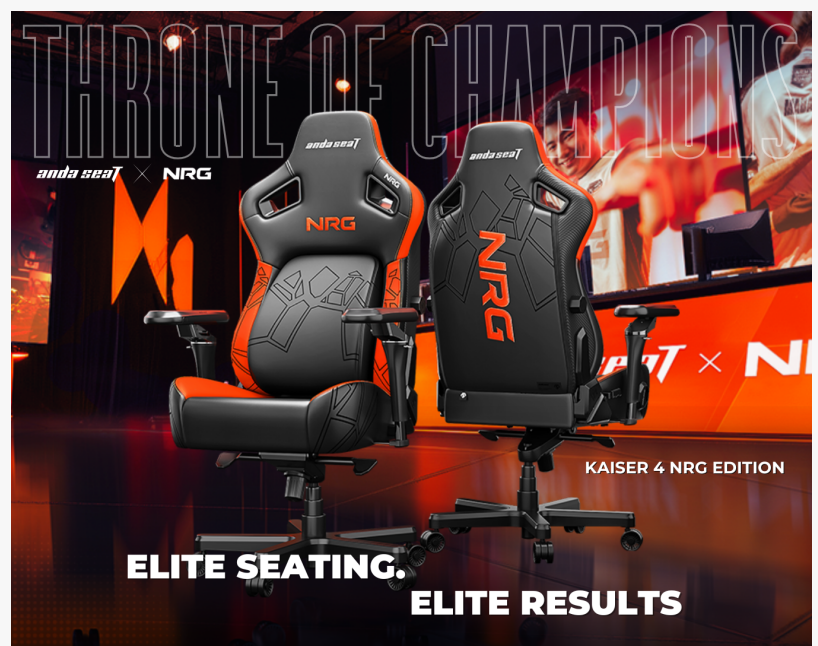
AndaSeat x NRG

The initial conversations between AndaSeat and NRG began not with aesthetics, but with a clear question: What do competitive gamers, streamers, and serious enthusiasts actually need from their equipment in 2025? Both teams agreed that the answer was not found in superficial branding or incremental changes.