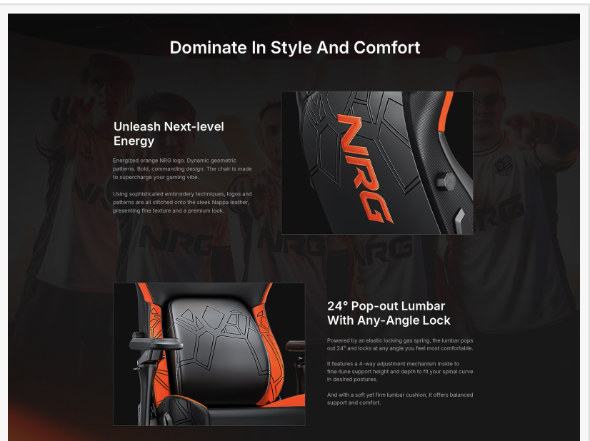
AndaSeat NRG Kaiser 4 Edition Detail

What sets this system apart is its infinite angle locking—a feature developed to ensure that, once users find the ideal support position, it remains stable and consistent, even during moments of physical tension or rapid movement. The internal mechanics, built with a hybrid of aluminum