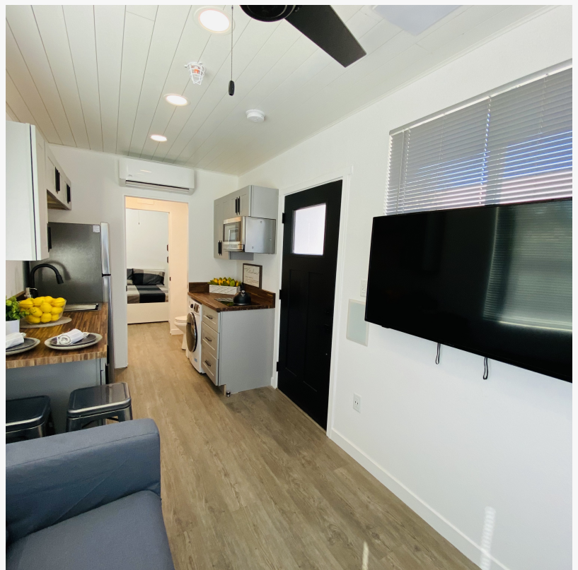
Vision 30 Interior