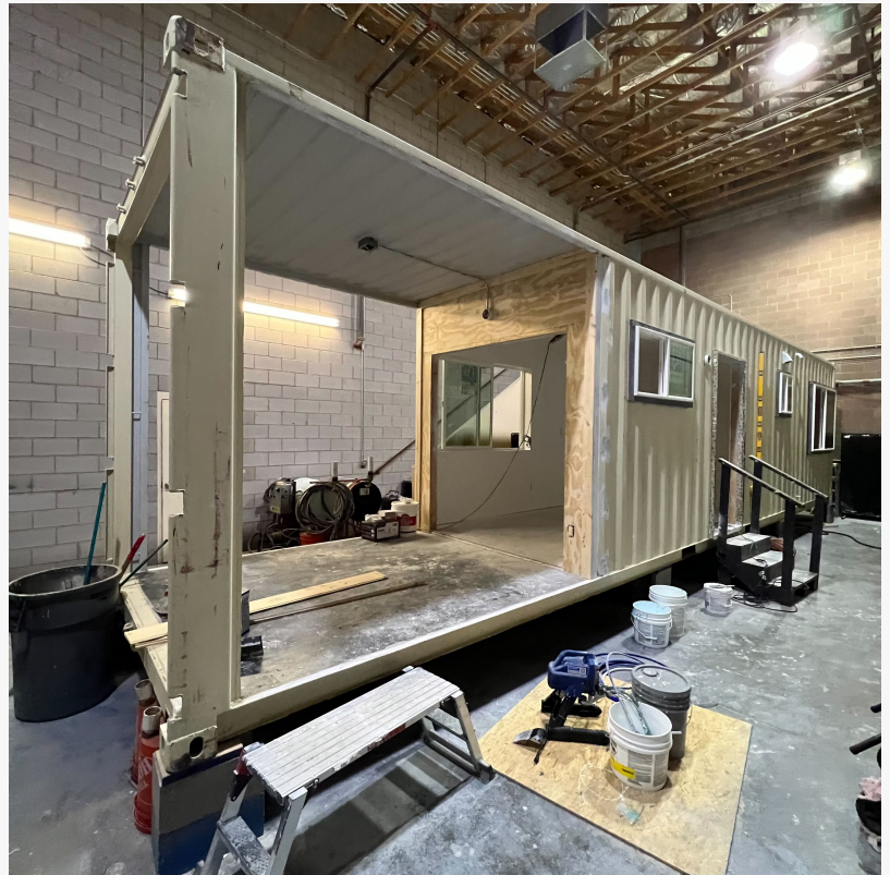
Vision 30 Patio under construction

Shipping container homes are growing in popularity with homeowners wanting to add a container home to their backyard or side yard as a guest house or for additional monthly rental income. Shipping container homes can be installed and ready for move in the same day they are delivered from the builder. On-Wheels options which place the container home on a heavy-duty new trailer that is similar to an RV/Travel trailer is an option that is popular for buyers living in jurisdictions that may not allow container homes but will allow RV/Travel trailer storage on their