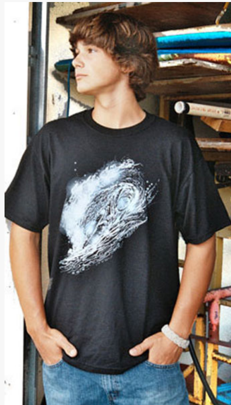
Tshirt With Wave Art - GodPowerTees