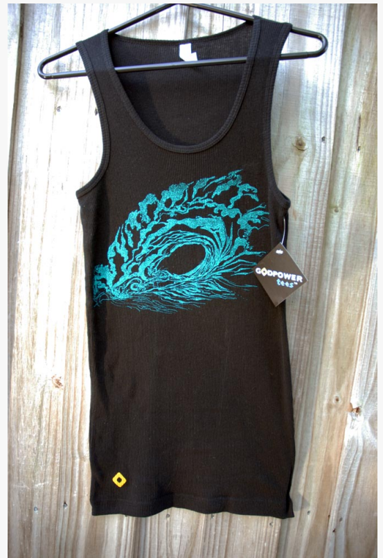
Women's Tank With Wave Art Print - GodPowerTees