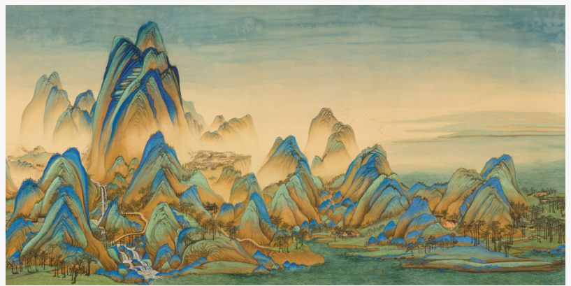
Traditional Meets Contemporary: The Revival of Song Dynasty Imperial Aesthetics in Modern Chinese Art