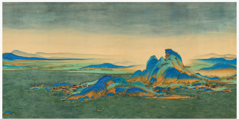
Traditional Meets Contemporary: The Revival of Song Dynasty Imperial Aesthetics in Modern Chinese Art

"She transforms static landscape scrolls into dynamic visual experiences that engage multiple senses," noted a representative from Shanghai Painting & Calligraphy Publishing House, which has published several collections of her work. The publishing house has been actively promoting this interdisciplinary approach as part of its strategy to revitalize traditional art forms.