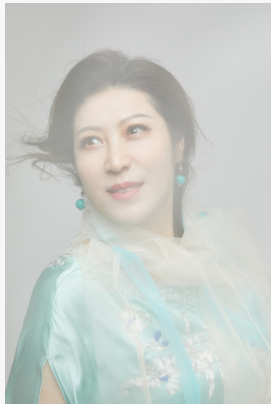
Traditional Meets Contemporary: The Revival of Song Dynasty Imperial Aesthetics in Modern Chinese Art