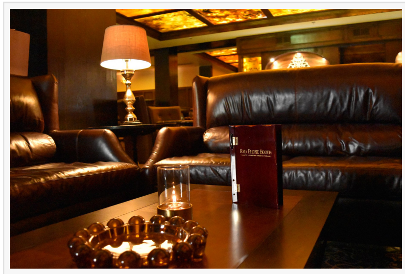
Red Phone Booth

Red Phone Booth sets the industry standard for elegant ambiance, expertly handcrafted cocktails and premium hospitality. Known for exclusive, memorable experiences, these intimate VIP evenings underscore Red Phone Booth's commitment to delivering extraordinary guest experiences in sophisticated settings.