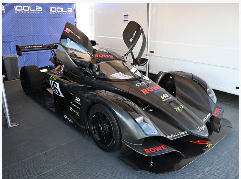
Car in development