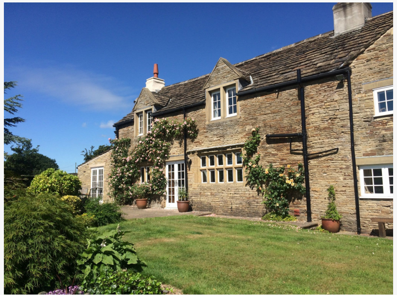
Country House on People Like Us - UK

Plutos represent a first in the home exchange sector , introduced to complement PLU's existing system called Globes. While a Globe allows a member to stay in another member's home for any agreed duration, many have hesitated to use them for shorter exchanges—reserving them instead for more substantial stays.