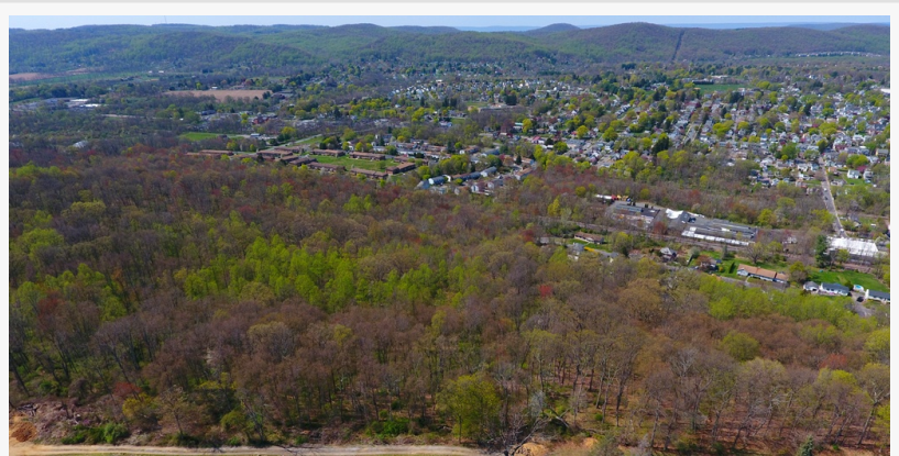
45.5+/- Acres, Washington Boro, NJ

Avenue in Washington Borough , Warren County, New Jersey. This residential development tract will be offered in a live, in-person auction with simulcast bidding on Tuesday, June 17, 2025, at the Courtyard by Marriott in Lebanon, NJ.