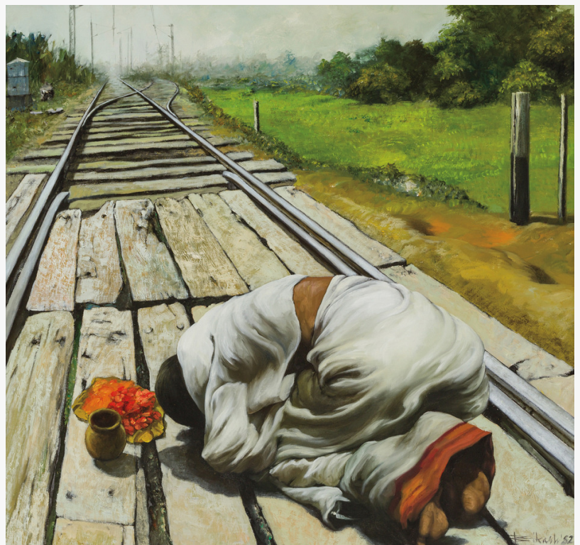
Oil on canvas by Bikash Bhattacharjee (Indian, 1940-2006), titled Worshipper (1982), signed and dated lower right, titled on reverse, 40 inches by 42 inches. Estimate: $80,000-$120,000. Sold for $100,000.

Leading the auction was a rare, early portrait by Cuban artist Wifredo Lam . It sold for $266,700 (including buyer's premium). The portrait was well-documented in the catalogue raisonné and other publications and had been in a private collection for nearly 50 years.