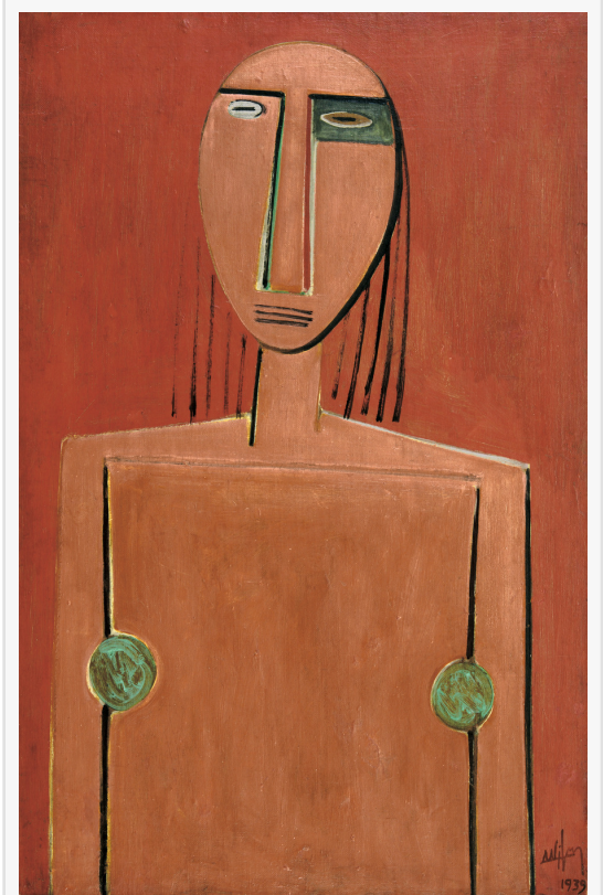
Oil on canvas by Wifredo Lam (Cuban, 1902-1982), titled Personnage No. 2 (1939), signed and dated, 36 ½ inches by 23 ½ inches. Estimate: $100,000-$150,000. Sold for $266,700.