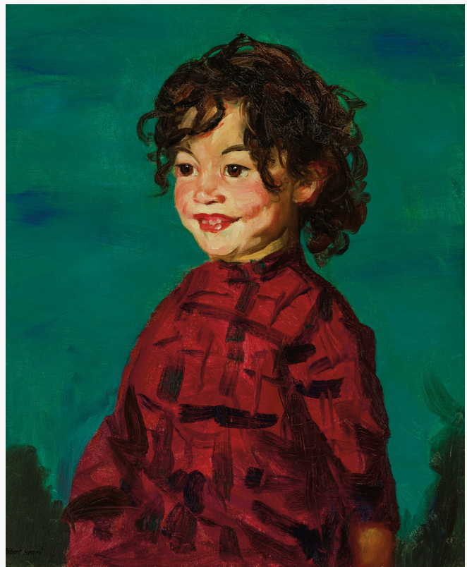
Oil on canvas by Robert Henri (American, 1865-1929), titled Patience (Laughing Youngster) (1915), signed, 24 inches by 20 inches. Estimate: $80,000-$120,000. Sold for $88,900.