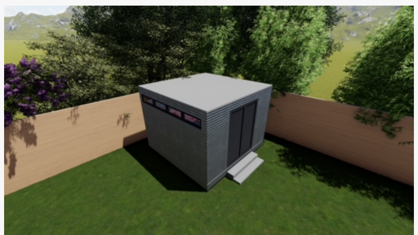
Sample Gilayo Modular Unit

company's innovative modular steel structures, which can be deployed quickly and with minimal environmental impact, are poised to become a critical part of the state's housing efforts.