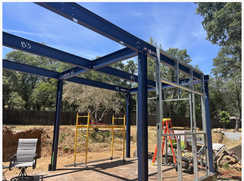
Gilayo® Frame Model Building Project