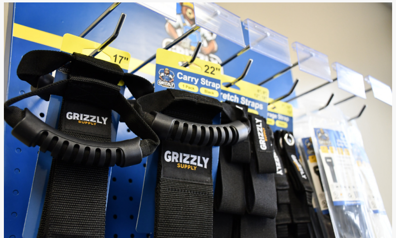
New Grizzly Supply Hook and Loop products including Carry Straps and Stretch Straps next to their already popular cable ties

BRUNSWICK, OH, UNITED STATES, May 20, 2025 /EINPresswire.com/ -- Grizzly Supply , a new brand aiming to redefine the cable management category, is proud to announce the launch of its all-new Hook and Loop Cable Management Line. While most well-known for their cable ties, Grizzly Supply's new product line focuses on hook and loop straps and material. This product expansion includes 40 brand-new SKUs designed to help professionals, DIYers, gamers, and organizers keep their spaces secure and organized.