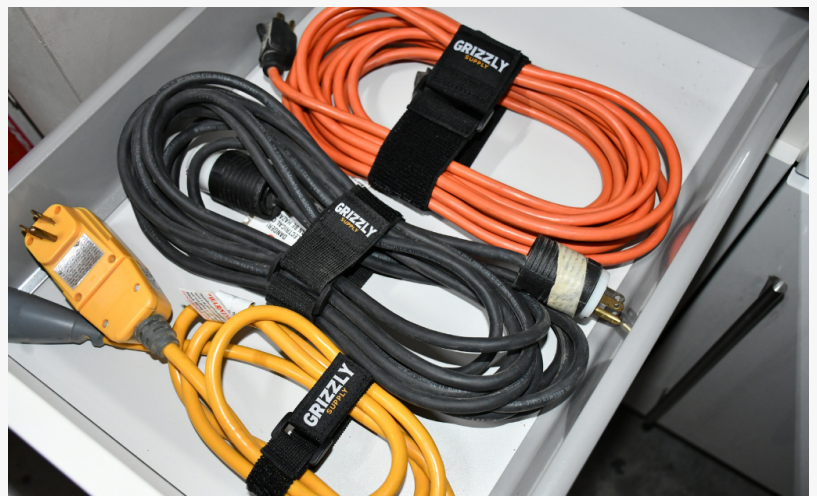
Hook and Loop Stretch Straps Can Neatly Organize Any Space

Cable Labels: Color-coded tags designed specifically for easy identification and labeling of different cables and wires.