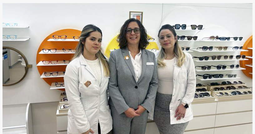
Stanton Optical Knoxville Staff Celebrating Grand Opening

KNOXVILLE, TN, UNITED STATES, May 16, 2025 /EINPresswire.com/ -- Stanton Optical, a leader in affordable and accessible eye care with over 300 locations nationwide, is thrilled to announce the grand opening of its newest location in Knoxville (Crown Pointe). Located at 6542 Clinton Hwy, Knoxville, TN 37912, this milestone marks the fourth Stanton Optical store in the Knoxville area and the seventh in the state of Tennessee.