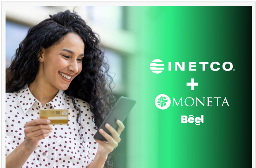
INETCO Powers Fraud Defense for Moneta's Next-Gen Digital Payments Platform, Beel

Real-time AI defense, built into every payment transaction