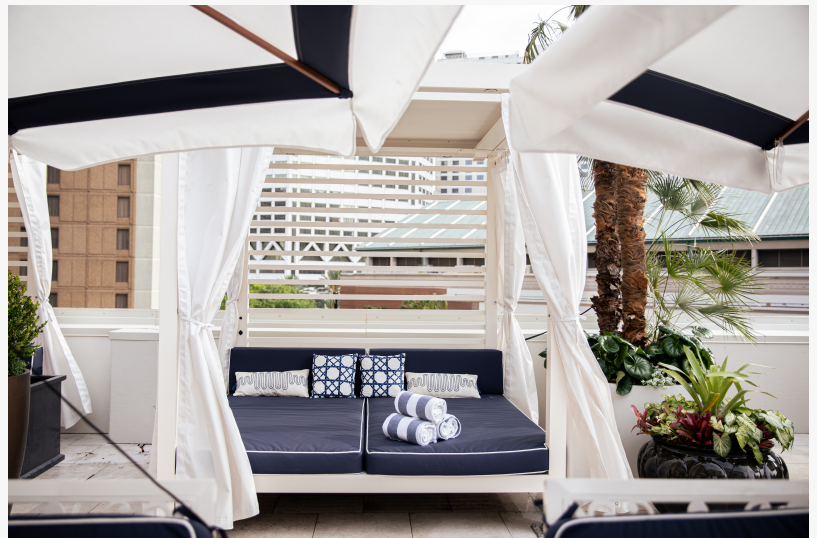
The Windsor Court Rooftop Pool Cabana