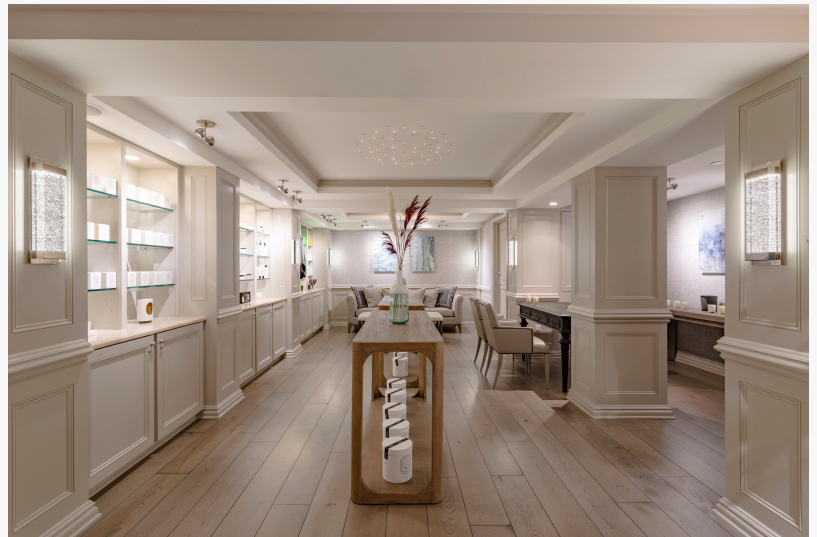
The Windsor Court Spa

The Windsor Court, an elegant escape in the heart of a legendary city, is proud to announce the launch of an inspired new collection of signature treatments and enhancements that redefine the wellness experience at The Windsor Court Spa . Infused with therapeutic botanicals, potent antioxidants, and sensorial rituals, these new offerings invite guests to embark on holistic journeys of restoration and renewal.