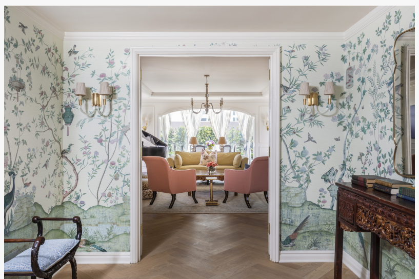
The Windsor Court Presidential Suite

The Windsor Court Spa is open daily from 9 am – 5 pm, reservations are required. The Windsor Court Spa features nine treatment rooms including two wet rooms, one couple’s treatment room, and