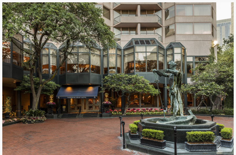
Entrance to The Windsor Court