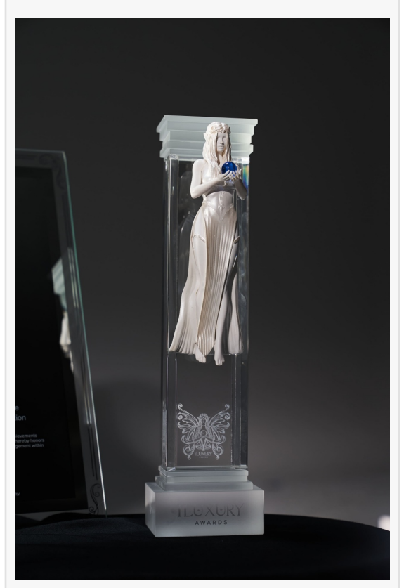
Novis Series iLuxury Award 2025 AndaSeat

7cm, providing support for different arm positions and reducing strain on the shoulders and