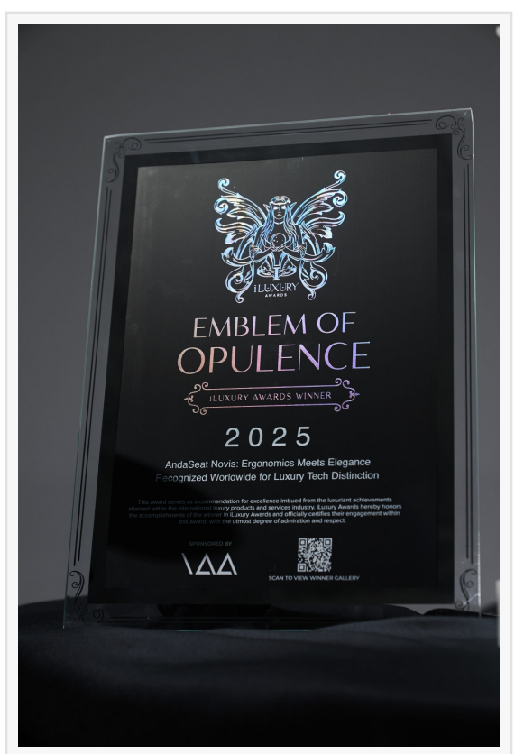
Novis Series iLuxury Award 2025

Customizable Seat Height and Armrests Users can adjust the seat height by 10cm, accommodating a variety of desk heights and personal preferences. The armrests are vertically adjustable by