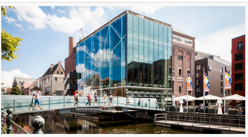
Lamot Congress and Heritage Centre, Mechelen

BELGIUM, May 21, 2025 /EINPresswire.com/ -- <u>CSR Europe</u> is proud to announce the European Sustainable Industry Summit 2025, taking place on 24–25 June at the <u>Lamot Congress and Heritage Centre</u>, in Mechelen, Belgium. Under the theme "Turning Sustainability into a