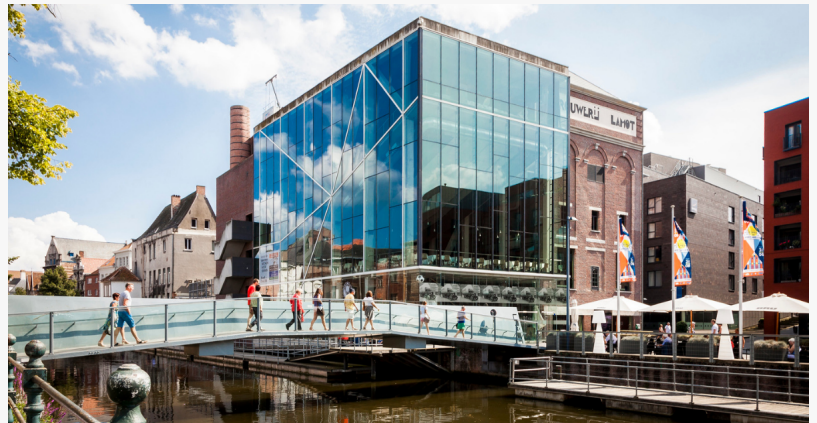
Lamot Congress and Heritage Centre, Mechelen