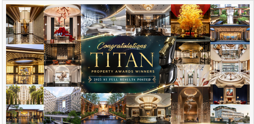
2025 TITAN Property Awards S1 Full Results Posted

NEW YORK, NY, UNITED STATES, May 20, 2025 /EINPresswire.com/ -- The TITAN Property Awards has announced the winners of its first season in 2025, honoring architects, developers, designers, and real estate professionals for their brilliance in the built environment worldwide. This year's competition received over 1,000 entries from over 30 countries, reflecting the growing international participation and the diverse range of projects shaping today's cities, communities, and living spaces.