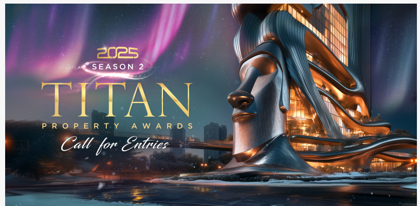
2025 TITAN Property Awards S2 Call for Entries

With the first season concluded, the TITAN Property Awards continues to honor excellence across architecture, property development, real estate, interior, lighting, and landscape design, as well as property marketing, providing a platform for projects that demonstrate practicality,