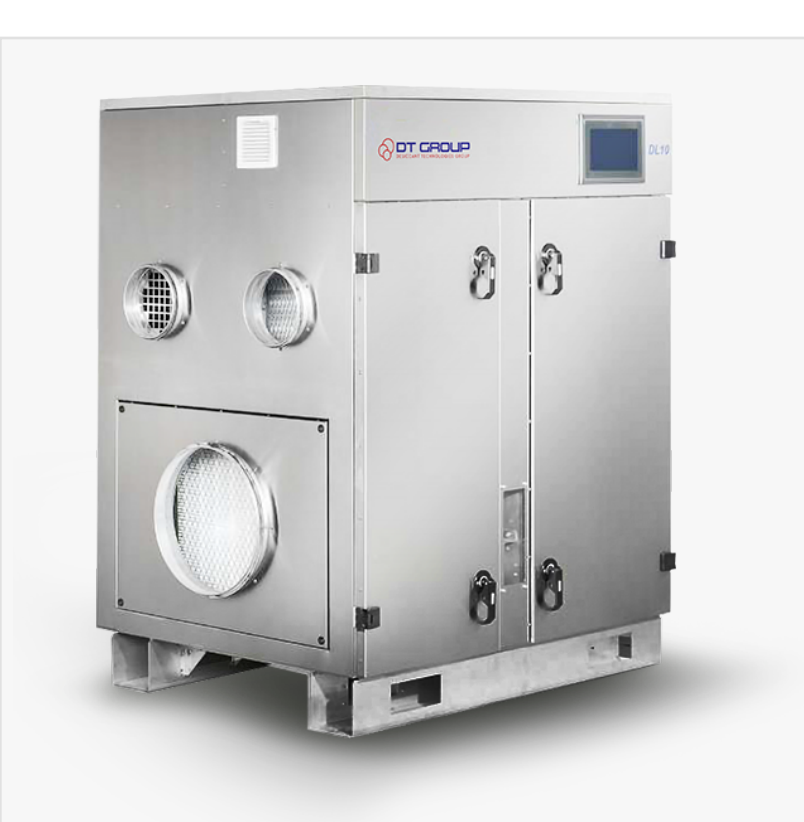
Desiccant Dehumidifier DL Range

Ashraf Ismail Vision Air Conditioning Trading Corp +1 825 925 5655 email us here Visit us on social media: LinkedIn