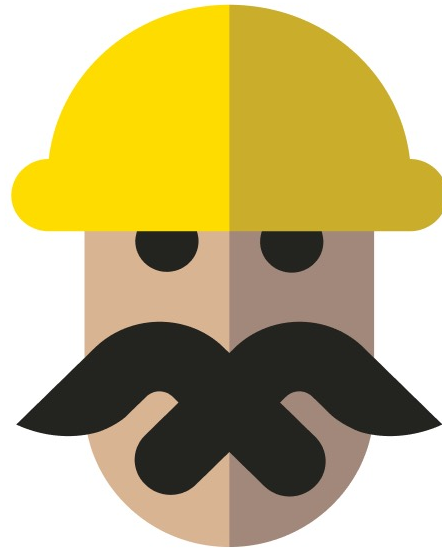
Fieldman Asset & Work order management software

Under this partnership, Fieldman's field service management platform will power all Utilities One Group smart meter installation projects. Fieldman's technology provides mapping of meter locations, collection of data in the field with real-time validation, ensuring that every meter is installed correctly and that accurate reading data is transmitted seamlessly to billing systems.