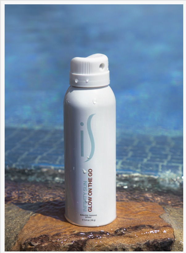
Infinity Sun Glow on the Go Self Tanning Mist 3.4 oz

This press release can be viewed online at: https://www.einpresswire.com/article/813107874