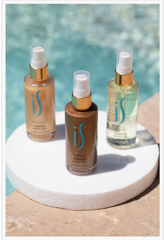
Infinity Sun Sunless-Safe Body Oils

The 2025 Miss California USA competition will be held on August 8th-10th, 2025 at the Grand Hyatt Indian Wells Resort & Villas, Indian Wells, CA, drawing contestants from across the state to compete for the coveted crown and the opportunity to represent California at the national level.