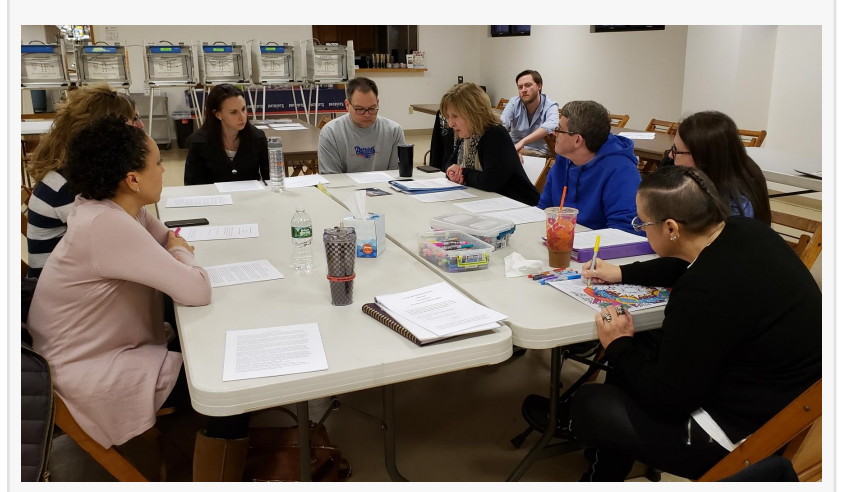
Wellness Workshop Table

This press release can be viewed online at: https://www.einpresswire.com/article/813110592