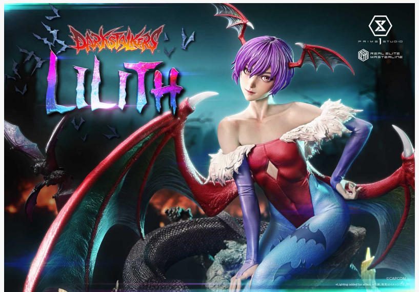
Real Elite Masterline Darkstalkers Lilith

The base is designed in a gothic style, incorporating elements such as a coiled serpent, petrified figures, and candles. The "Bonus Version" also