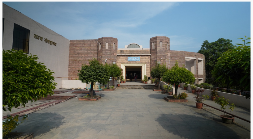
State Museum, Bhopal