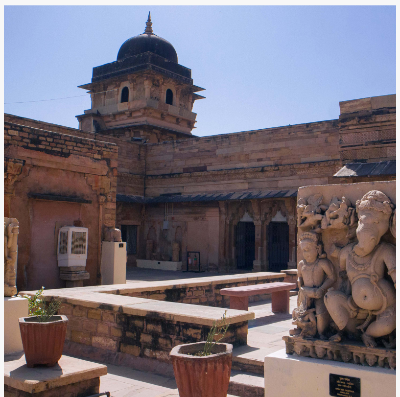
Gujari Mahal Museum, Gwalior

A newer yet spiritually significant addition is the Triveni Archaeological Museum in Ujjain, inaugurated during Simhasth 2016. The museum features three thematic galleries—Shaiva, Vaishnava, and Shakta—reflecting the Triveni concept, based on three major spiritual traditions: