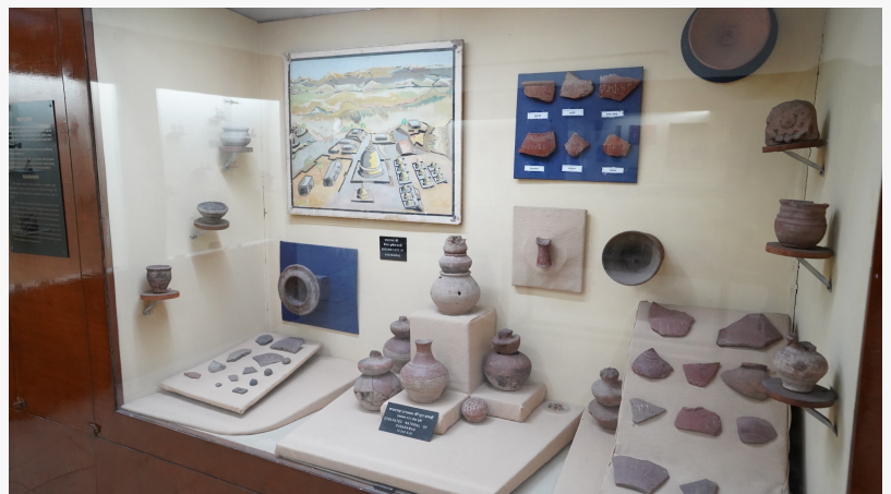
Central Museum, Indore