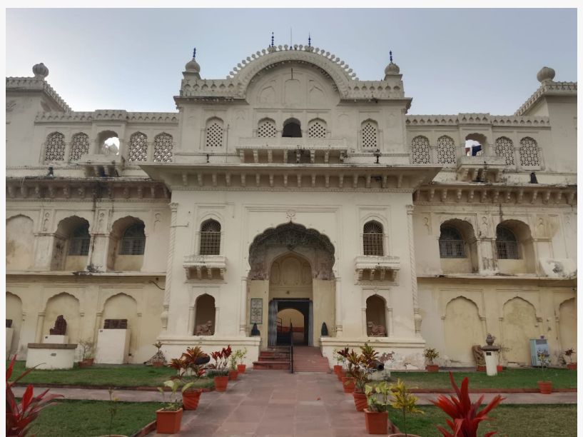
Maharaja Chhatrasal Museum, Dhubela Palace