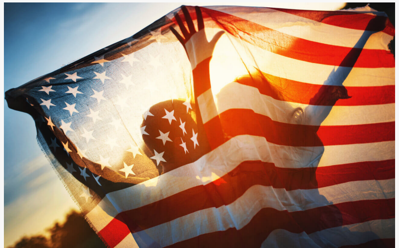
E2 Visa USA