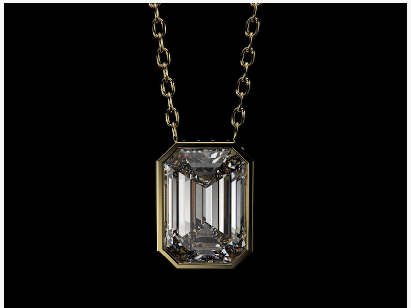
The sumptuous 5 ct Lab - grown diamond set in a 18K RG pendant donated by RobinHood Diamonds to The Race To Erase MS Charity in Hollywood, May 16, 2025 , valued at $28,000 Retail

Nancy embodies hope, courage, and resilience, and she tirelessly pursues the goal of finding a