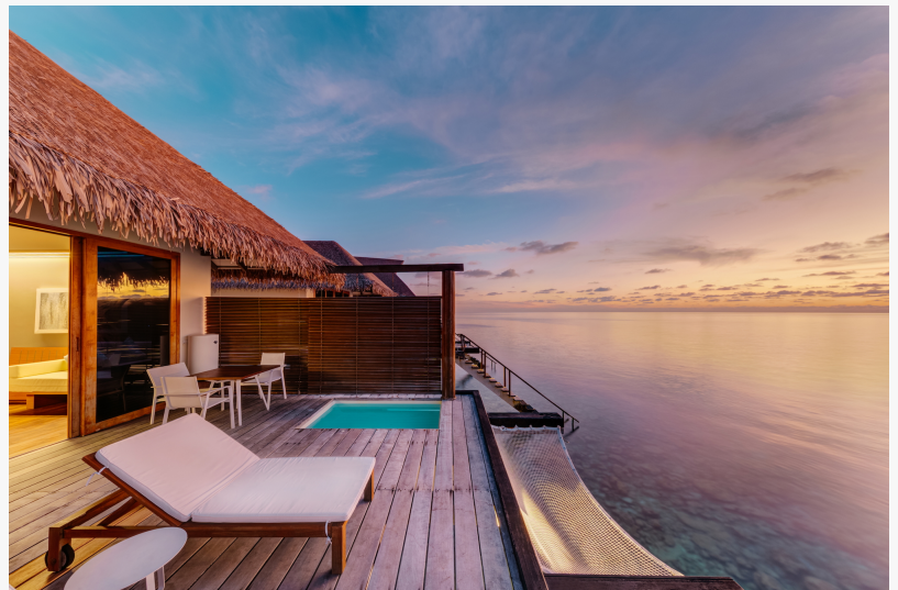
Sunset Water Bungalow with Jacuzzi at Cinnamon Velifushi Maldives

Located in the pristine Vaavu Atoll and offering uninterrupted 360-degree beach access, Cinnamon Velifushi Maldives is home to five accommodation categories, including the Sunset Water Bungalows with Jacuzzi. These overwater rooms provide direct lagoon access, with opportunities to spot marine life such as reef fish, manta rays, and dolphins.