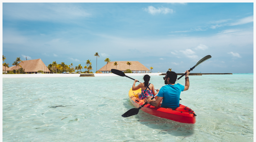
Canoeing at Cinnamon Velifushi Maldives