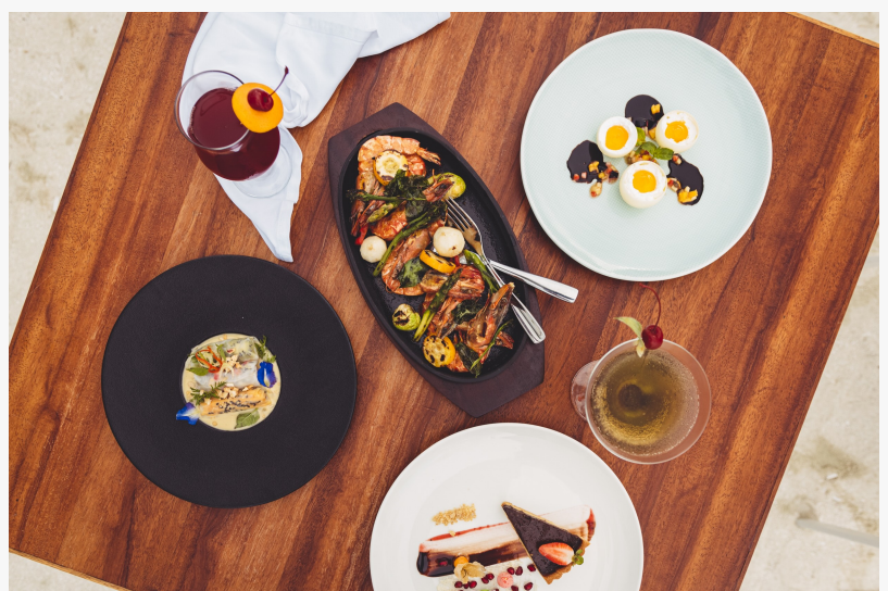
Food at Cinnamon Velifushi Maldives