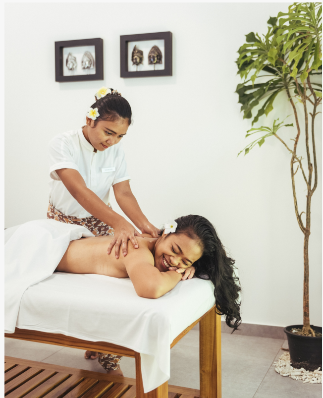
Spa at Cinnamon Velifushi Maldives