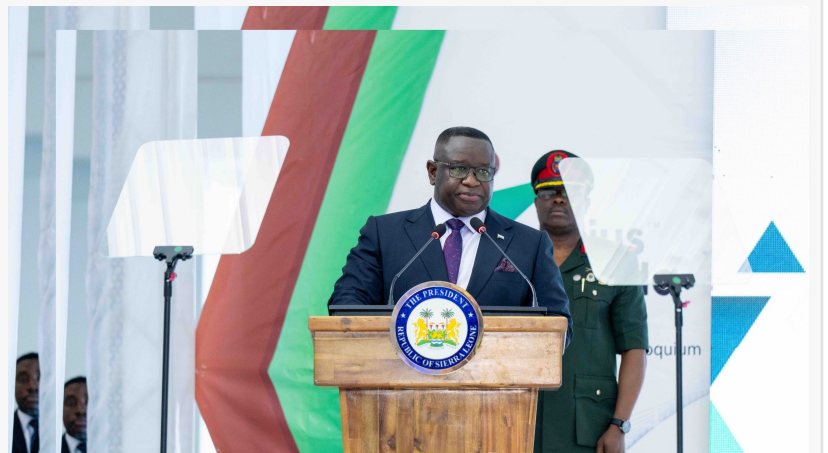
President Bio Delivering the Keynote Address

The One-day event featured keynote addresses, expert panel, and fireside conversation. Participants examined contemporary challenges and opportunities across the continent, including education reform, technology and innovation, gender equity, climate resilience, and regional integration.