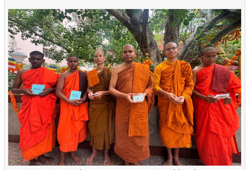
Participation in the program organised by the Mahabodhi Society's at Bengaluru to promote the state's Buddhist Circuit

Tourism, Government of Uttar Pradesh. "The Buddha's journey, from renunciation to