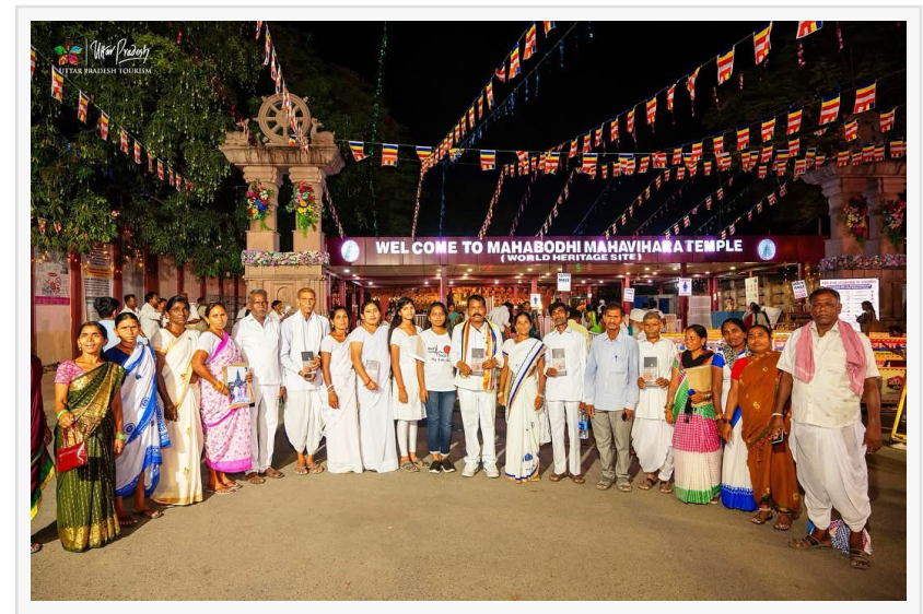
Uttar Pradesh Tourism participated in the Trividh Purnima event at Bodhgaya to promote peace, compassion and inner awakening.

Sarnath: In a significant tribute to Lord Buddha, the Department of Tourism & Culture, Government of Uttar Pradesh, in collaboration with the Central University of Tibetan Studies, Sarnath, unveiled the Dhih Research Journal (Buddharpan) during Buddha Purnima celebrations. The event, marked by the ceremonial lighting of lamps and the chanting of Pali and Tibetan mantras, blended spirituality and scholarship, reinforcing Uttar Pradesh's commitment to preserving and promoting Buddhist heritage.