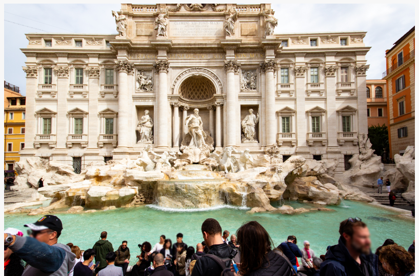
On most days, heavy crowds inundate the top-ten sites including the beautiful Trevi Fountain.