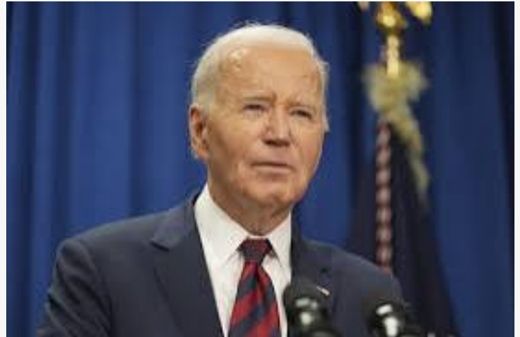
Former President Joe Biden facing the challenge of an aggressive form of prostate cancer that's metastasized to the bones