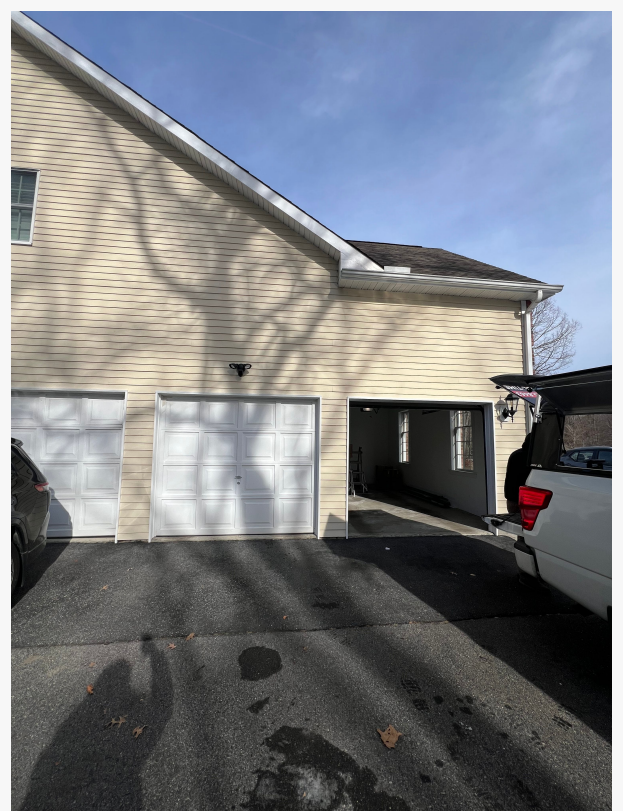
A glimpse behind the scenes showcasing our skilled team working on garage door installations and repairs.

Case Study: Residential Upgrade with Smart Tech Jessica White had been considering upgrading her outdated garage door system for years. After consulting with Double Time, she opted for a modern, Wi-Fi enabled model with quiet operation. The result not only improved the curb appeal