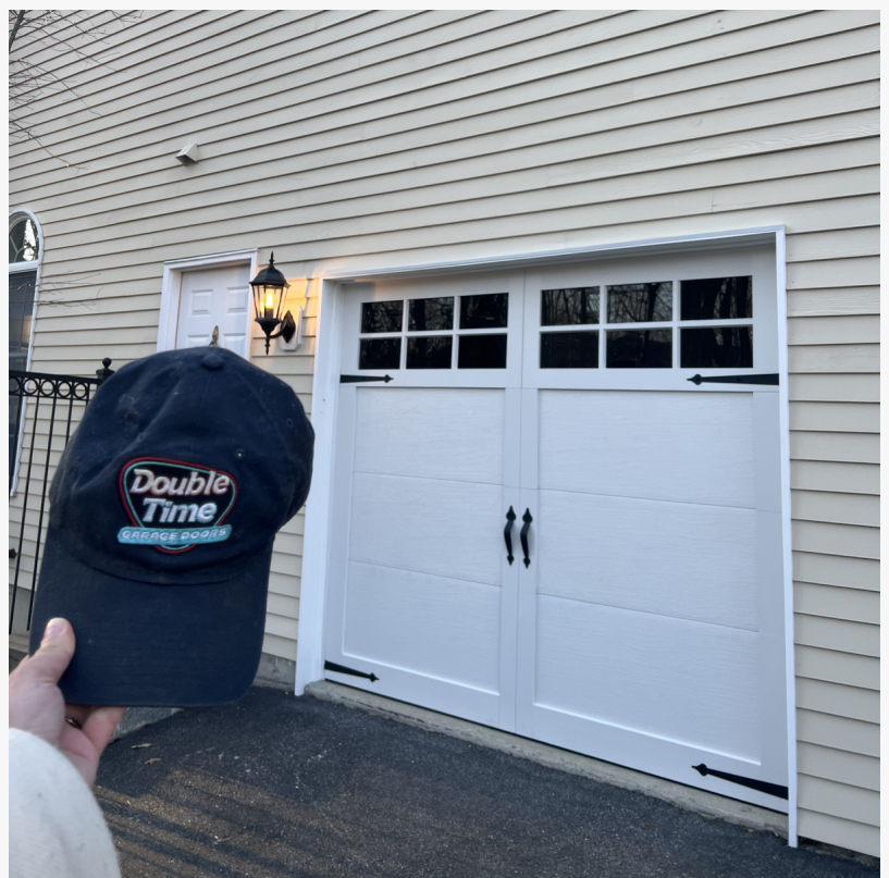
Double Time Garage Doors team installing a modern garage door in Norwalk, CT, showcasing professional service and quality craftsmanship.