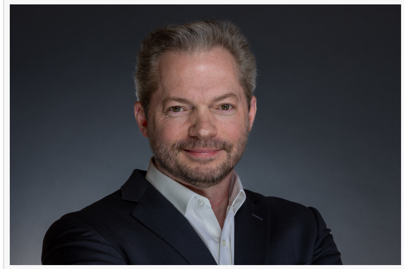
Corporate Headshot Photographer

already in the building, so we set up a mobile studio right in the convention center. Attendees can walk away with a polished, professional headshot in minutes."