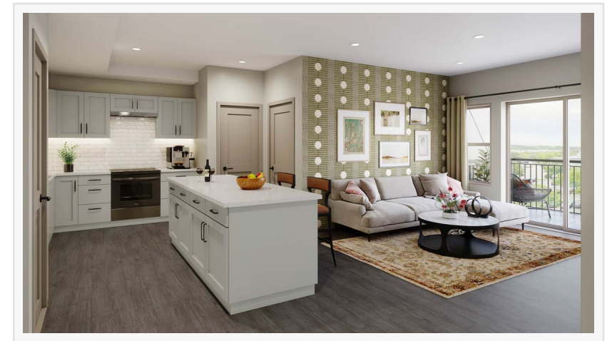
Bright, modern apartment with open layout, designer finishes, and access to outdoor views.

cocktail bar for socializing. Stay active in the Smart Fitness center, visit the full-service salon, or access on-site therapy. With 24-hour clinical staff, medical alert systems, and personalized transportation, peace of mind is assured. Pet-friendly policies, spacious living quarters, and housekeeping services create a maintenance-free experience, while proximity to I-25 and Denver International Airport keeps residents connected to urban conveniences and Colorado's landscapes.