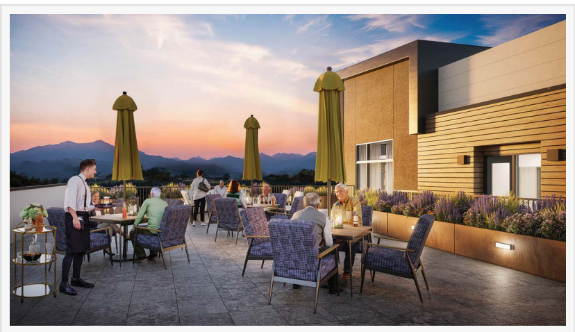
The Sky Lounge balcony will offer breathtaking views of the Front Range.

FORT COLLINS, CO, UNITED STATES, May 19, 2025 /EINPresswire.com/ -- Set to open in late 2025, The Gallery at Fort Collins introduces a fresh approach to senior living in Northern Colorado, blending independent living, assisted living, and memory care within an artinspired community. By consolidating essential costs into a single, predictable fee, The Gallery offers financial savings and a lifestyle rich in creativity, connection, and care. Now accepting priority deposits, it invites seniors to secure early access to a community designed to celebrate their unique stories. Here's why this allinclusive model makes The Gallery a smart choice for both your wallet and well-being.