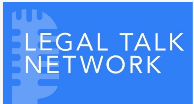
Legal Talk Network Logo