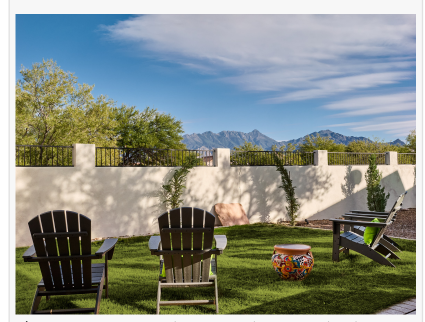
The Haven Detox - Arizona Scenic Mountain View

Unlike many facilities, The Haven Detox - Arizona is designed to make detox and recovery more humane and accessible. Medicaid patients have access to evidence-based therapies such as cognitive behavioral therapy (CBT), trauma-informed care, motivational interviewing and holistic wellness options such as yoga and meditation.