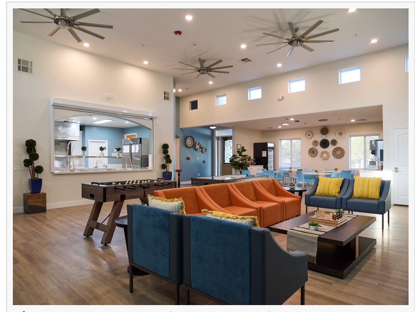
The Haven Detox - Arizona Recreation Room