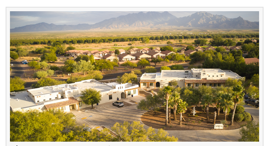
The Haven Detox - Arizona

TUCSON, AZ, UNITED STATES, May 20, 2025 /EINPresswire.com/ -- A new mental health and addiction treatment center vows to bridge the critical care gap for Arizona Medicaid patients on long waitlists. The Haven Detox - Arizona offers the state's most comprehensive behavioral health