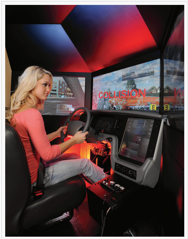
Driving Fundamentals Simulator Labs. DrivingMBA's state-of-the-art technology provides realistic, hands-on training in different "real world" driving scenarios.