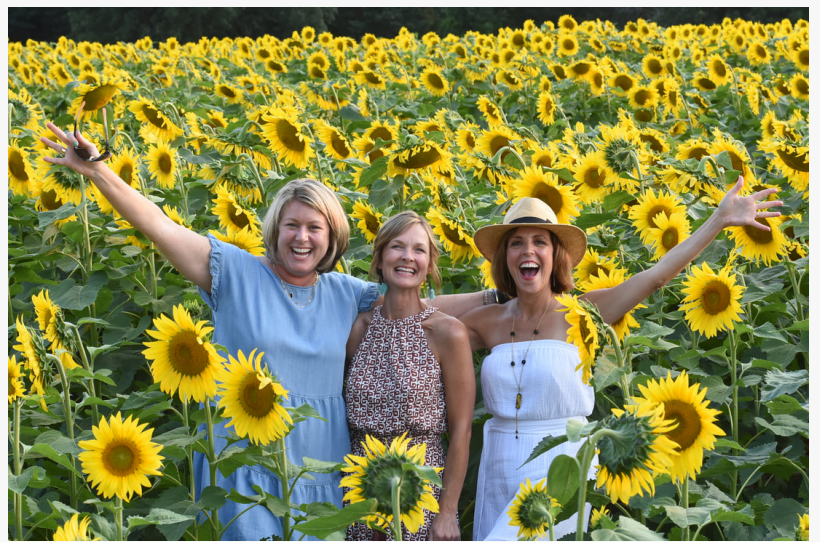
Capture yourself in the midst of Sunflowers

Led by MI Fitness Community, with all proceeds supporting the Earl Farm Foundation.