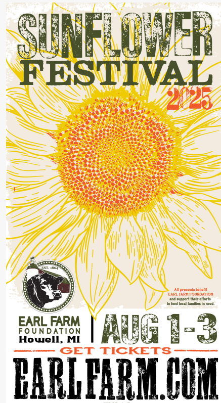
Official 2025 Sunflower Poster