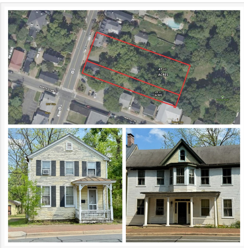
204 & 208 N. King St., Leesburg, VA 20176