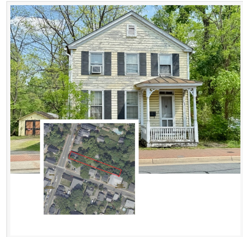
204 N. King St., Leesburg, VA 20176