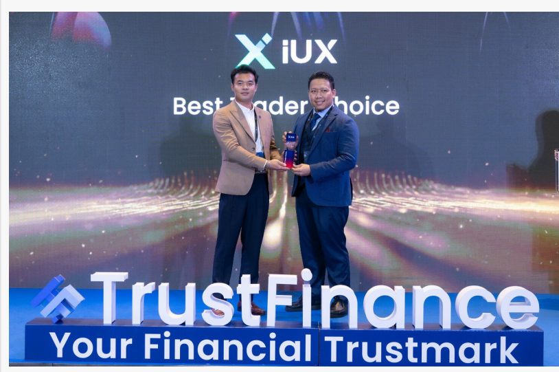
IUX Wins "Best Trader Choice" at TrustFinance Awards 2025

execution speeds, intuitive platform design, highly responsive customer support, and a transparent, education-driven approach. These qualities have helped the company maintain a consistently high TrustScore and strong user satisfaction across global markets.