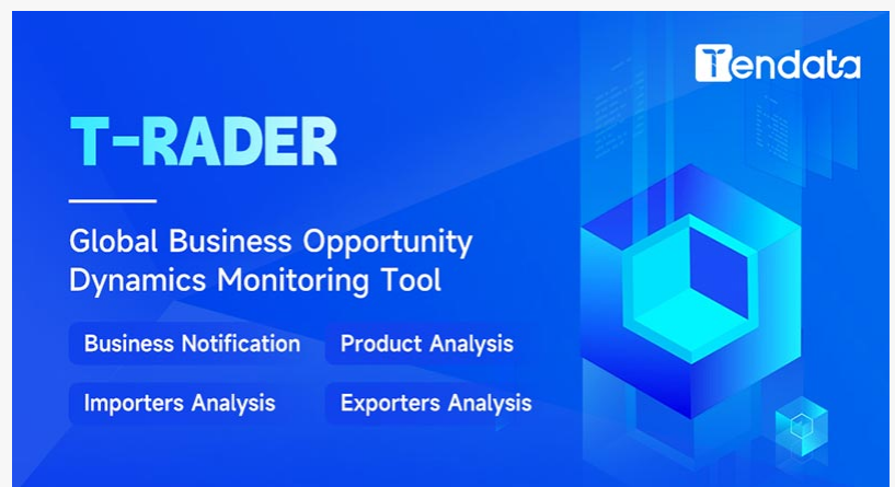
Tendata Releases the Landmark "2024 Global Trade Data Report"