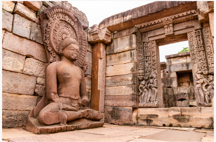
Ancient Buddha Statue at Sanchi Stupa