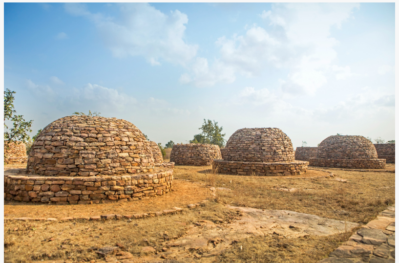
Deur Kothar, Rewa