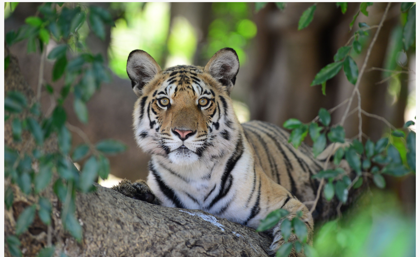
Tiger spotting at Panna Tiger Reserve