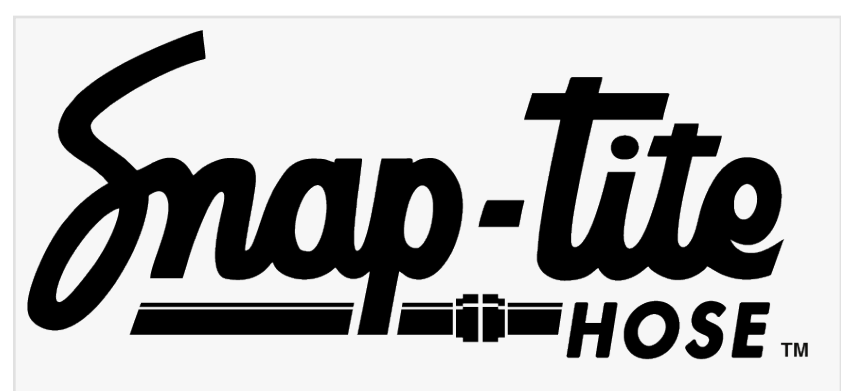
Snap-tite Hose logo

This initiative reinforces Snap-tite Hose's transition from equipment manufacturer to mission partner for fire service organizations. The company recognizes that many departments, especially volunteer organizations, face unique funding