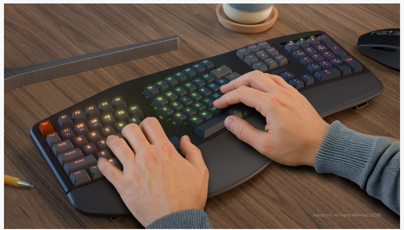
Ergonomic Design for Comfort with Reliable Performance

RGB LED Backlighting – Dynamic lighting effects enhance visibility and style.