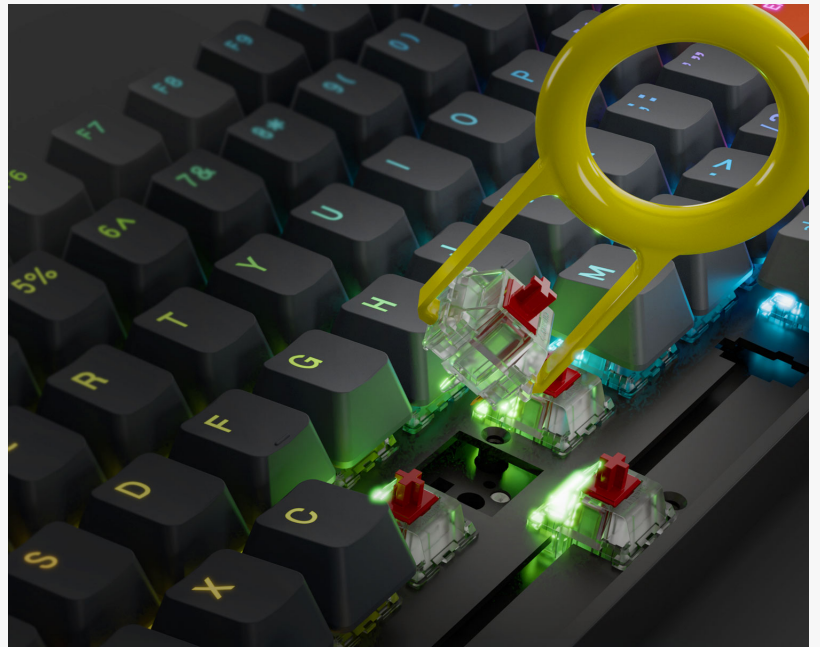
Featuring swappable RED Cherry MX key switches

Andrew Ackloo Adesso Inc marketing@adesso.com