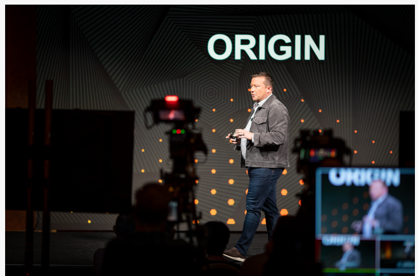
Las Vegas Corporate Event Photographer

Speaker panels, award ceremonies, and banquets