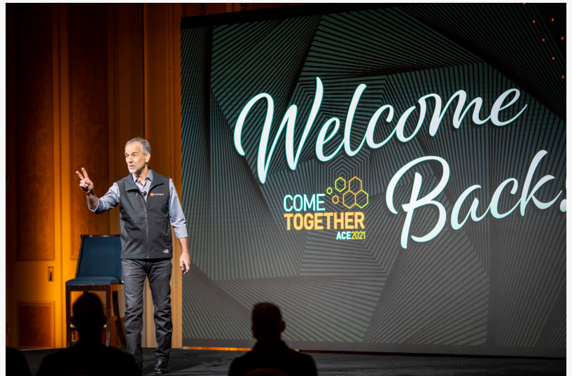
Las Vegas Corporate Event Photographer

LAS VEGAS, NV, UNITED STATES, June 9, 2025 /EINPresswire.com/ -- Corporate gatherings, conferences, and brand-focused events continue to drive demand for high-quality photography services in Las Vegas. Christian Purdie Photography, a commercial studio based in the region, has been recognized for its continued work in providing corporate event photography across a variety of industries and venues.