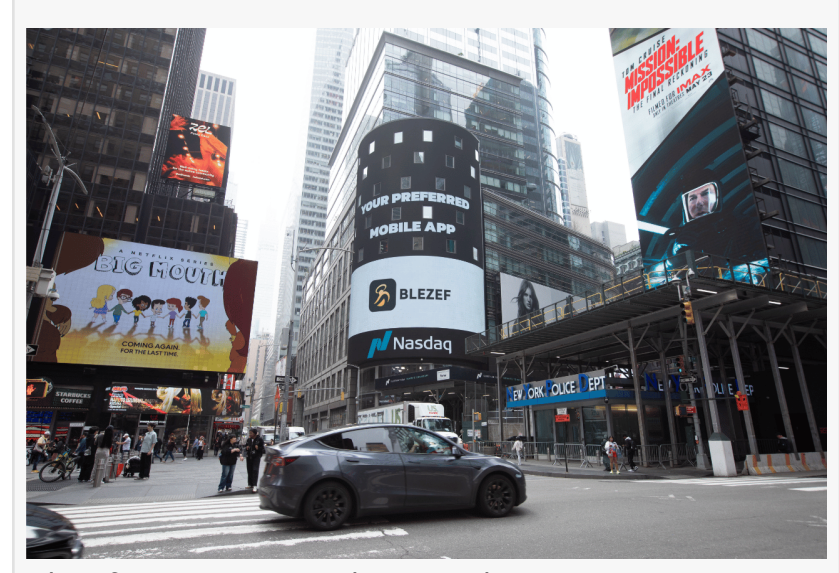
Blezef (BZFX) Featured on Nasdaq Times Square Billboard