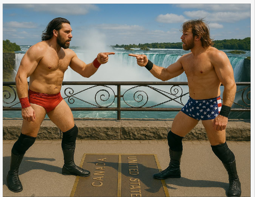
Border Brawl

Zone-ify is a free, ad-supported streaming platform delivering live events, FAST channels, movies, short-form content, and exclusive programming to audiences across the U.S. and Canada. Available on Roku, Amazon Fire TV, Apple TV, Comcast, DIRECTV, Cox, Rogers, Bell, mobile devices, and the web, Zone-ify reaches over 422 million consumer devices and 16 million Pay TV households. With 75+ curated channels, a growing slate of live ring sports, and bold original content, Zone-ify is where niche meets mainstream — all in one place, always free. Learn more at www.zoneify.tv .