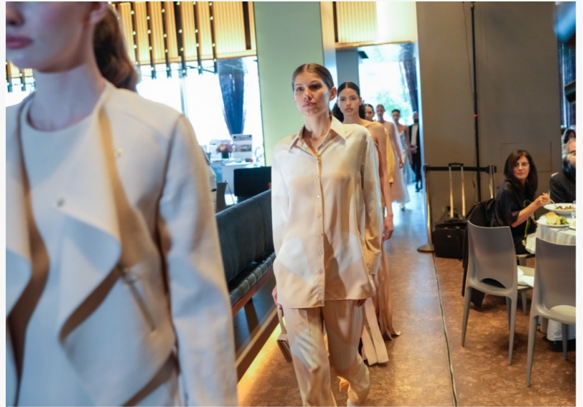
Atmosphere