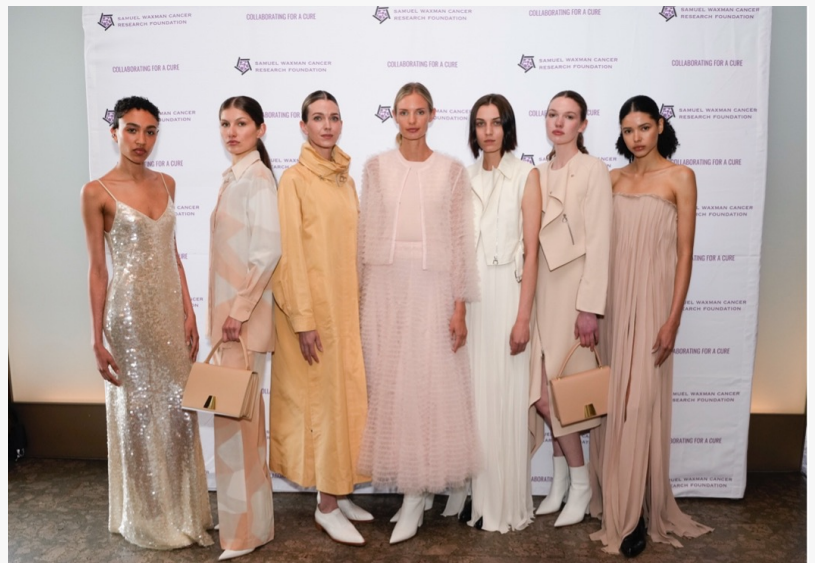
Akris Collection Models