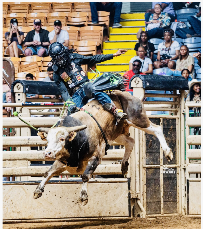
BPIR Bull Rider Texas Connection Series Fort Worth, TX.

Earlier in the day, BPIRF (Bill Pickett Invitational Rodeo Foundation) hosted a dynamic "Saddle Up with BPIRF – Ridin' High with STEM" youth workshop for 50 local students. In partnership with the USDA Natural Resources Conservation Service, the workshop introduced young minds to career paths in agriculture while connecting Western heritage to science and innovation.