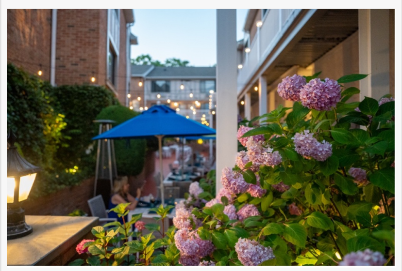
Southampton Inn Courtyard

the Hamptons has to offer from historic villages, museums, art galleries, and more, all at a great value for money price point. Breakfast and brunch is served daily at Claude's. Claude's, The Library, The Ballroom, the newly renovated Flying Point Room and gardens are all popular spots for parties and events.