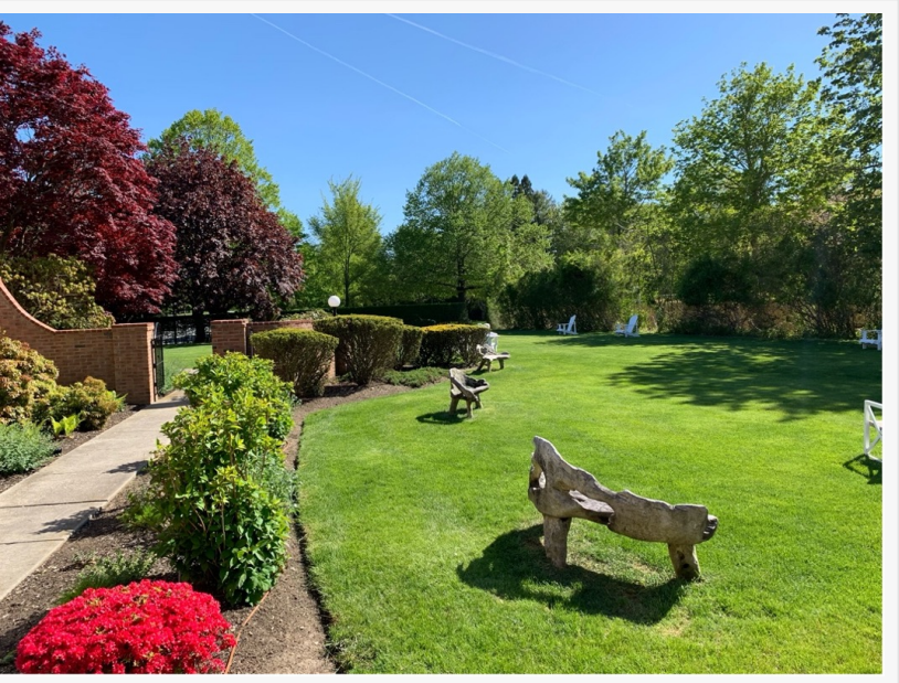
South Lawn at the Southampton Inn

About the Southampton Inn: The Southampton Inn has 90 thoughtfully appointed, charming rooms laid out in a Tudor style village design set in acres of manicured lawns in the heart of the village of Southampton. World famous beaches, boutiques, restaurants and local gems are only minutes away on foot. The Inn is the perfect home base to enjoy all